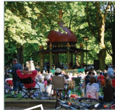
Interstate Corridor URA Dawson Park Gazebo restoration celebration