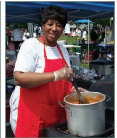
Oregon Convention Center URA "Good in the Hood" neighborhood fair