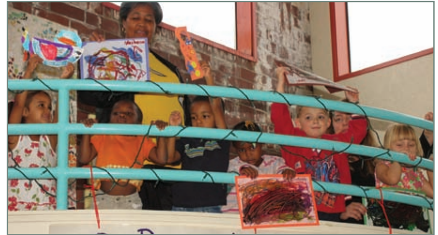
Urban renewal funds provided much needed repairs to the Peninsula School in the Interstate Corridor Urban Renewal Area (URA).